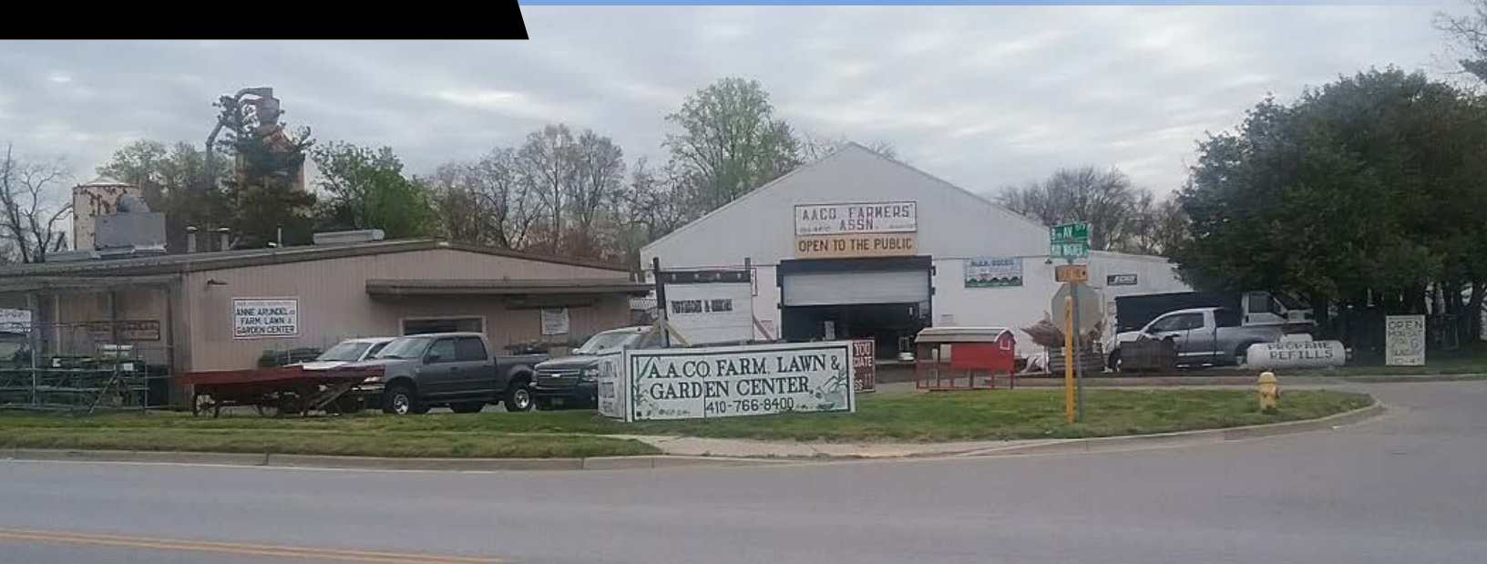
The Anne Arundel County Farmer's Coop Building